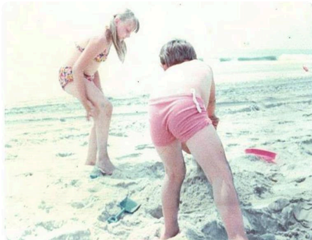
Cute little butt!